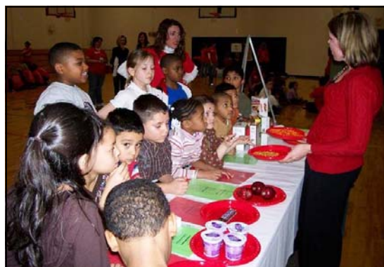
Learning about portion sizes and nutritional values

The Community Impact Committee would like to thank the following community partners for their assistance with Kids in the Kitchen: