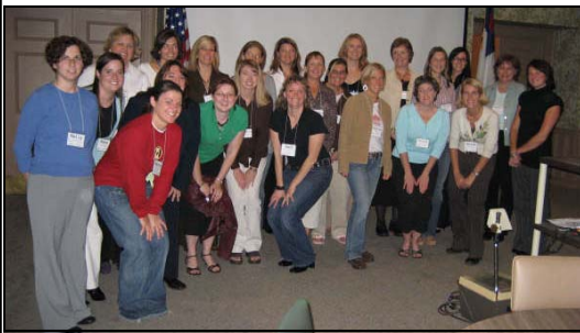
The 2006-2007 Provisional Class

On April 20 – 21, 2007, The Junior League of Fort Wayne gave approximately 218 volunteer service hours to Children's Hope House. Eighty percent of the Provisional class participated over the course of the weekend and we turned those six guest rooms from beige, beige, and more beige to warm and cheery. The scope of the project was huge! Once again, the 2006-2007 Provisionals went above and beyond. Give me an "I"...Improving the community in which we live!