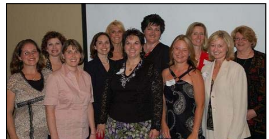
Our outstanding 2006-07 Board of Directors!