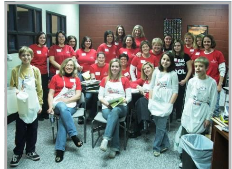
Kids in the Kitchen volunteers ready for the fun!

Here is big THANK YOU to all the people who helped to make this event successful!