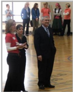
Fort Wayne's new Mayor Tom Henry helped us kick off the 2008 KITK event.

Obesity is an increasing problem for children in Allen County. Over 24% of Allen County low-income children under the age of 18 responded to the 2006 Low-Income Health Survey as being obese. The National Average for low-income children was 10% in the same survey. Obese children are at significantly higher risks of developing diabetes, high blood pressure, high cholesterol, and asthma.