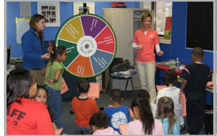
2008 Kids in the Kitchen participants enjoy playing the "Wheel of Health" on March 6 at the Fort Wayne Boys & Girls Club.