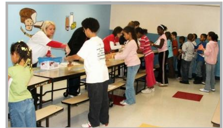
Building healthy snacks with JLFW volunteers