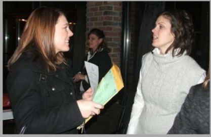
JLFW Members enjoy the social time after the February General Membership Meeting held at Club Soda

General Membership Meetings mix business with fellowship and fun!